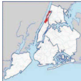
Morningside Heights, West Harlem and Hamilton Heights, Central Harlem, Washington Heights, Inwood